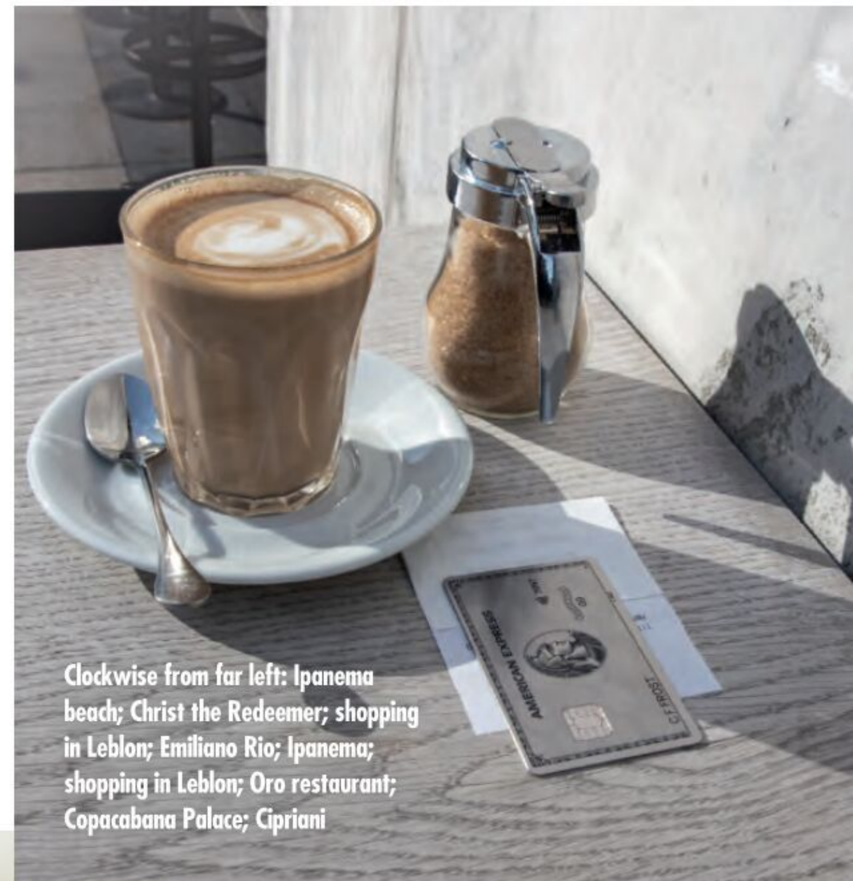
Clockwise from far left: Ipanema beach; Christ the Redeemer; shopping in Leblon; Emiliano Rio; Ipanema; shopping in Leblon; Oro restaurant; Copacabana Palace; Cipriani