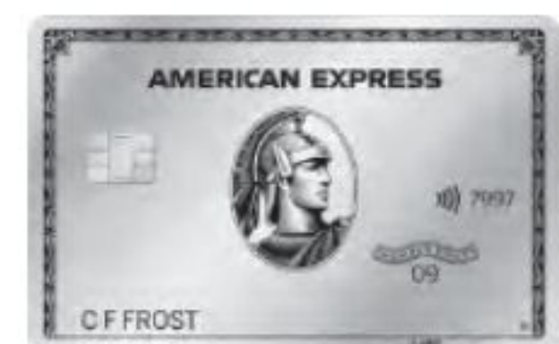
The Platinum Card®