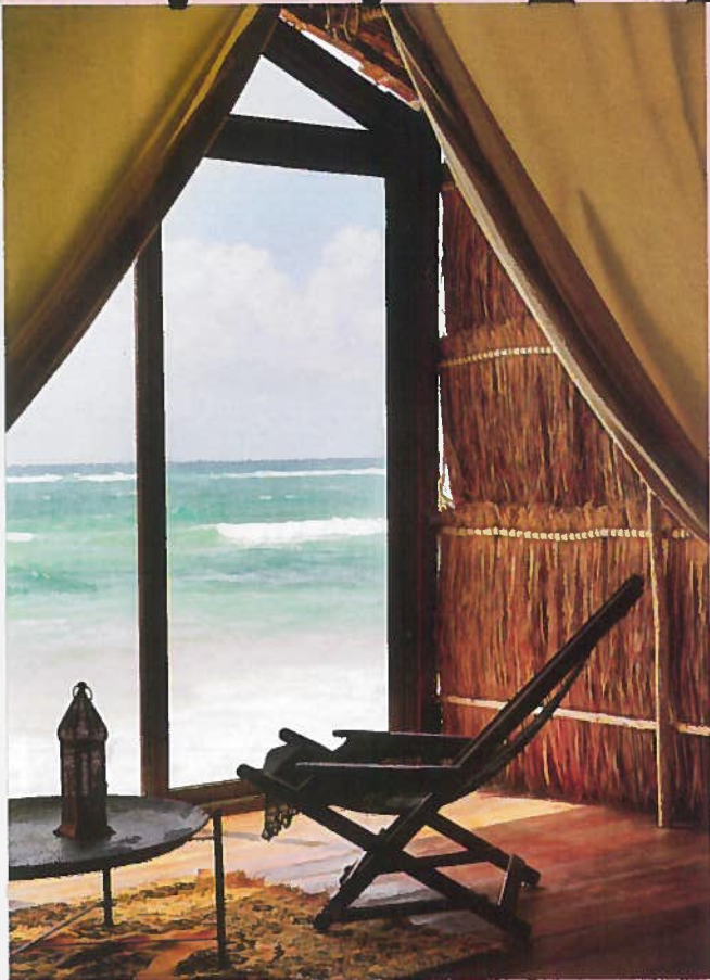
Habitas Tulum, Mexico