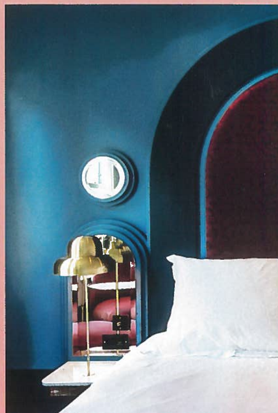
Henrietta Hotel, London, England