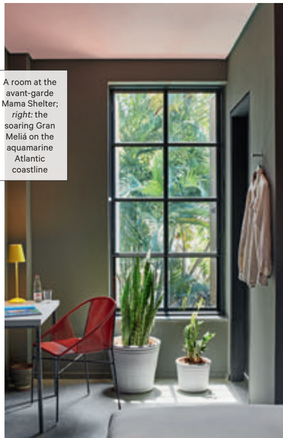
A room at the avant-garde Mama Shelter; right : the soaring Gran Meliá on the aquamarine Atlantic coastline