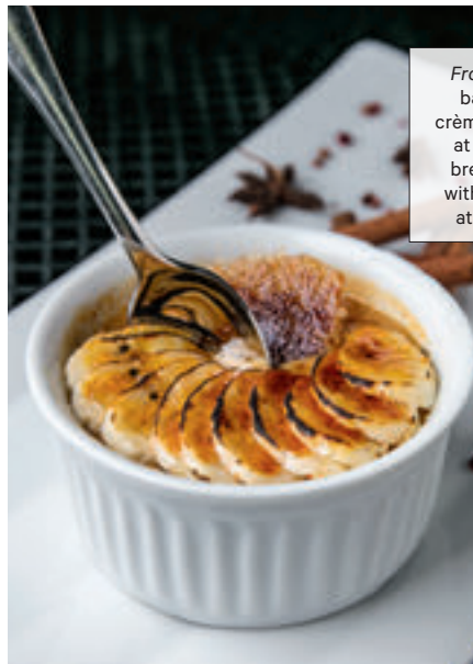
From left: banana crêpe brûlée at YOO2; breakfast with a view at YOO2